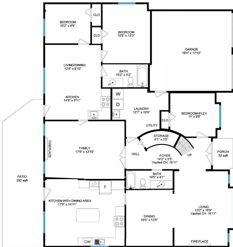
Main Floor CH: 8' - 16'11"